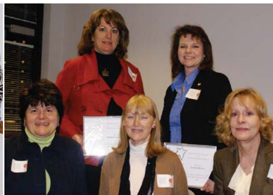
Recertified Board Educators - Ten Years of Excellence!